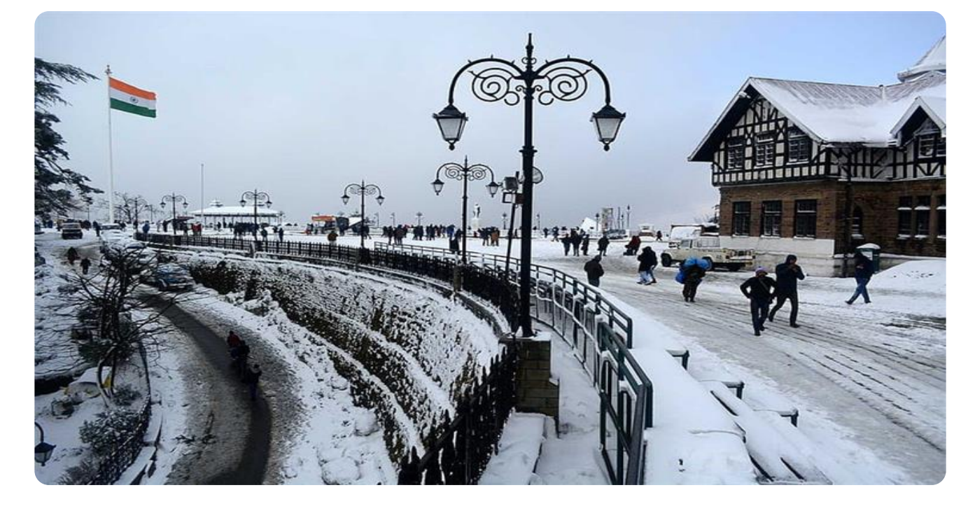
On arrival at Chandigarh, you will drive to Manali. On the way visit Sunder Nagar, Pandoh Dam, Hanogi Mata Temple, Kullu Valley and then head back to hotel for overnight.