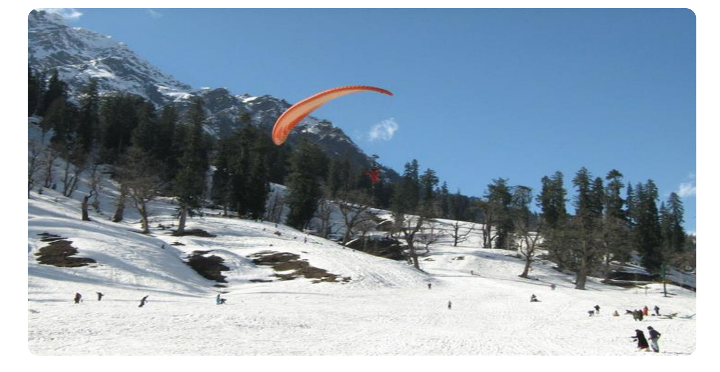
After breakfast excursion to Solang Valley and then head back to hotel for overnight.